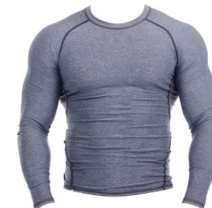
Long-Sleeve Rash Guards