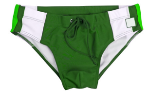
Short Swim Briefs