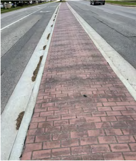
ROCK PRAIRIE ROAD WEST

4" thick raised colored (Butterfield, Integral – Base: U34 Brick Red, Release: R13 Deep Charcoal) and stamped (New Brick Running Bond) concrete with sub-base, or approved equal.