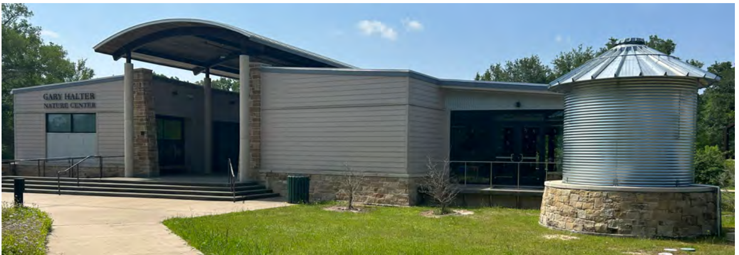
HALTER NATURE CENTER