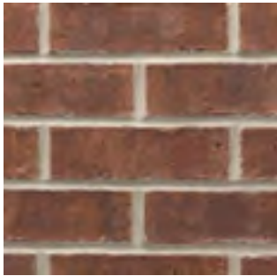
Acme Burgundy DTP137 Modular Heritage Texture