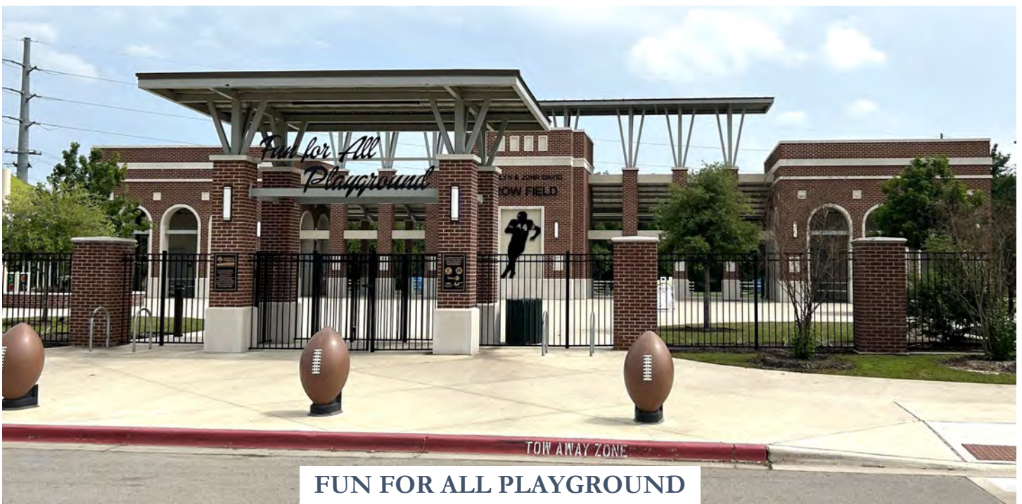
FUN FOR ALL PLAYGROUND