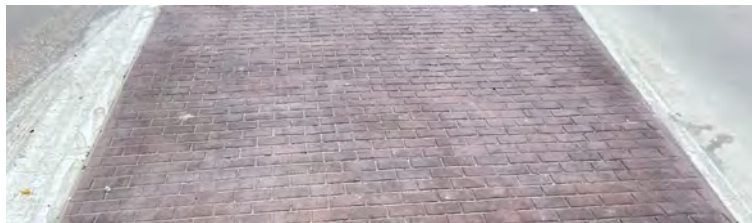
GREENS PRAIRIE ROAD