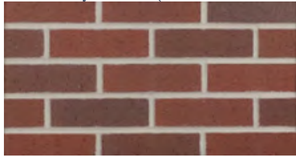
Sioux City Brick Modular Napa Valley Velour Texture