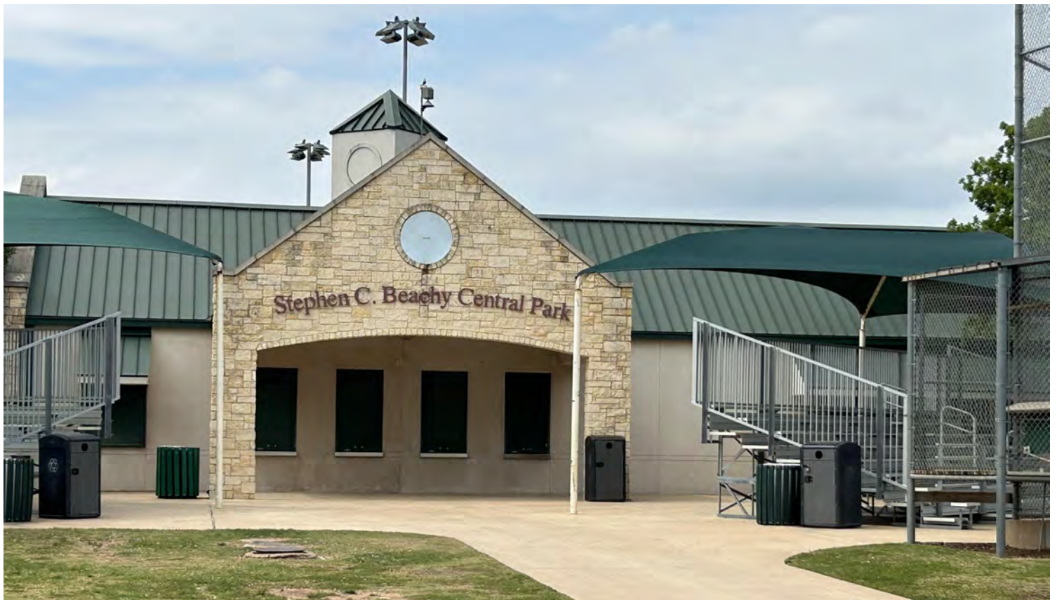
SOFTBALL CONCESSION & RESTROOM