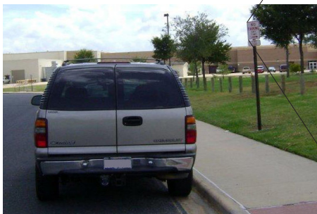
▶ Don't park in no parking zones.