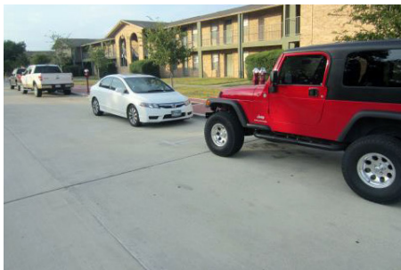
▶ Don't park facing traffic. Park in the direction of traffic flow.