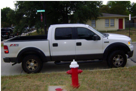
▶ Don't park within 15 feet of a fire hydrant.